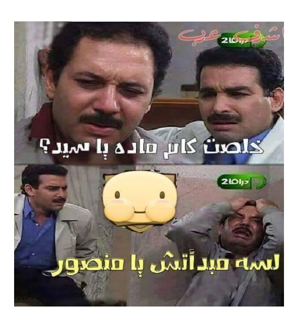
Image (1) represents two of the famous characters in the TV series (Souq Alasr) where one of them is responsible for the other. It is known for the viewers that Sayed as one of the brothers and sisters, is of bad luck in the TV series and Mansour is struggling with all of his brothers and sisters to get them better. The choice of the image represents the relationship between members to be like brothers and sisters and they are responsible for each other. The producer of the image represents the one who needs help and the viewer represents the one who is